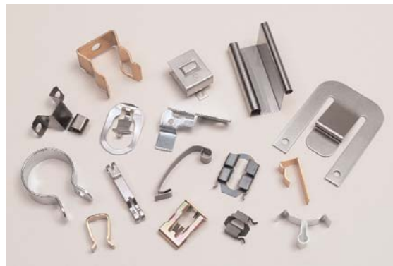
More fourslide-produced parts