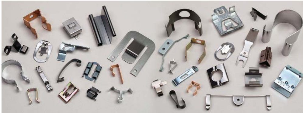
While the fourslide part making process was previously used mostly for complex work such as that with involved forming, multiple bends, or elements beyond 90-degrees, savvy manufacturers are now choosing the process over power press to slash part cost, speed product delivery, and streamline quality assurance.

One customer, for instance, required a switch to actuate every time a flat spring was depressed 0.5" within a certain tolerance. "If the springs were inconsistent, we had to adjust our finished goods by hand, which was time-consuming and expensive," says Heimroth.