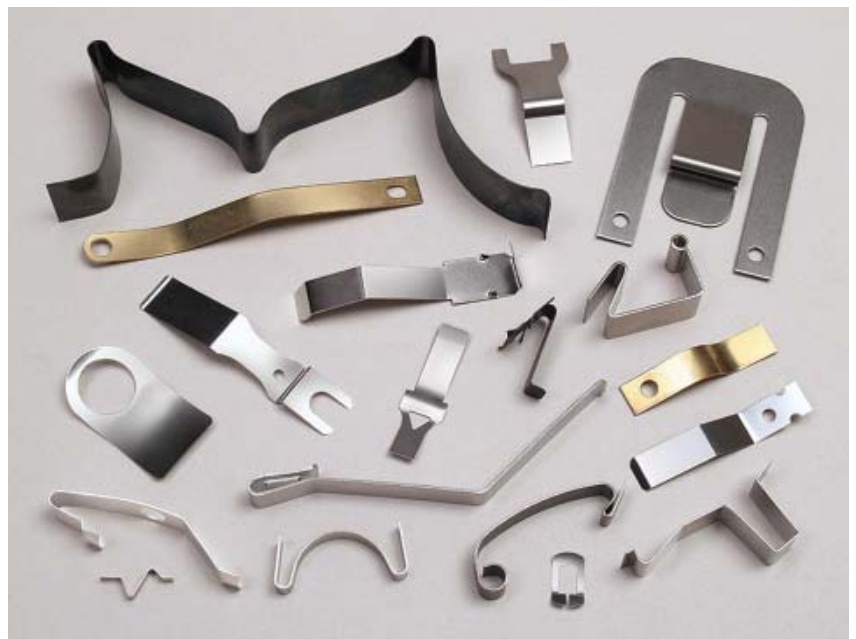
Flat springs -- like clips, clasps, clamps and a wide variety of stampings -- are particularly suitable for fourslide manufacture.

"Because the four slides move independently along two axes, they can precisely bend and form without the complex tooling required of power press machines," says Suchopar. "Combining forming with stamping in one operation, using fourslide we saved about 75 percent in tooling costs, and about 25 percent in total part costs."